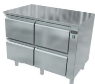
Aggregate - Standard